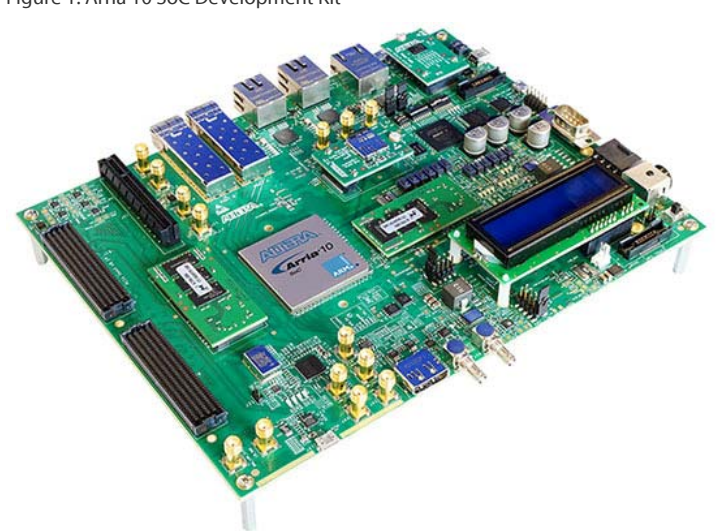
Figure 1. Arria 10 SoC Development Kit