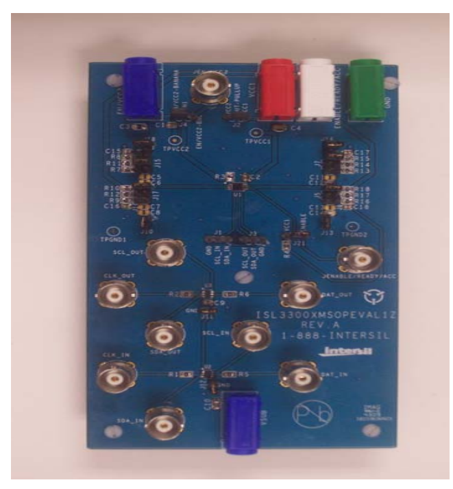
FIGURE 1. TOP VIEW